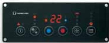
ClimaAire I D